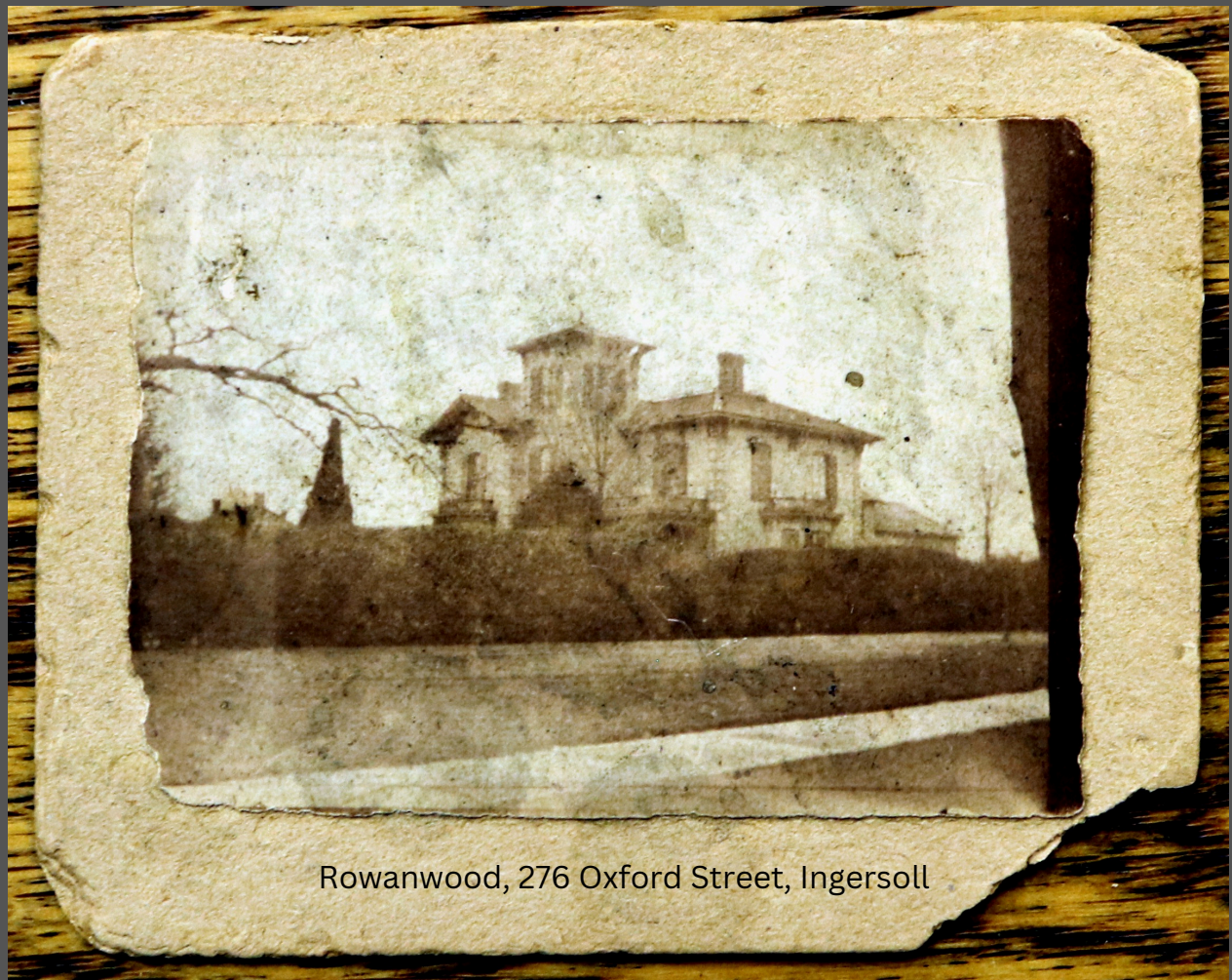
Rowanwood, 276 Oxford Street, Ingersoll