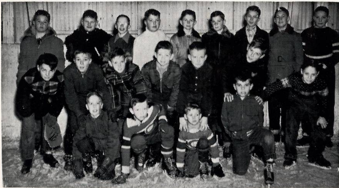
BLACKBIRDS IN SONG OF SIXPENCE