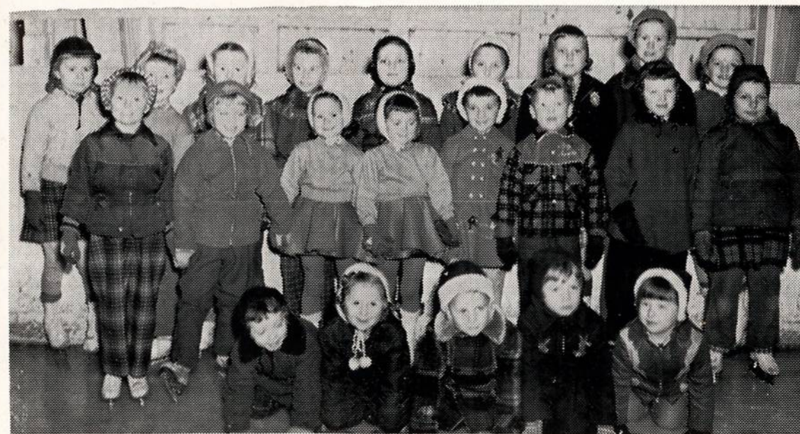
GROUP 2 BEGINNERS