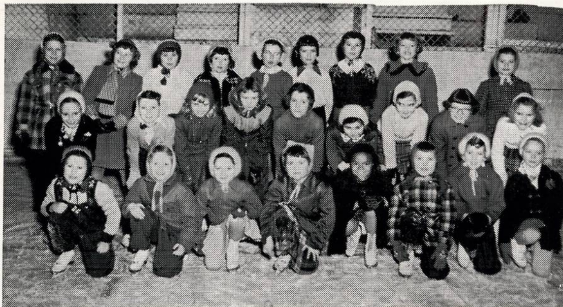
CHILDREN IN OLD WOMAN WHO LIVED IN A SHOE