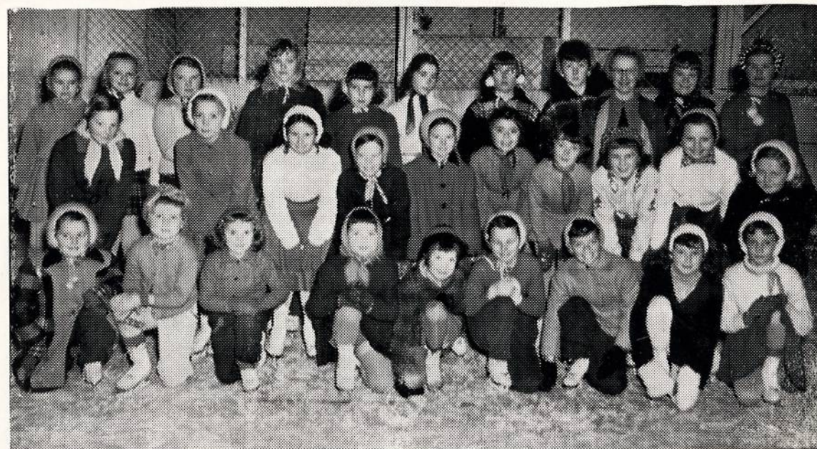
CHILDREN IN SCHOOL DAYS OF MARY HAD A LITTLE LAMB