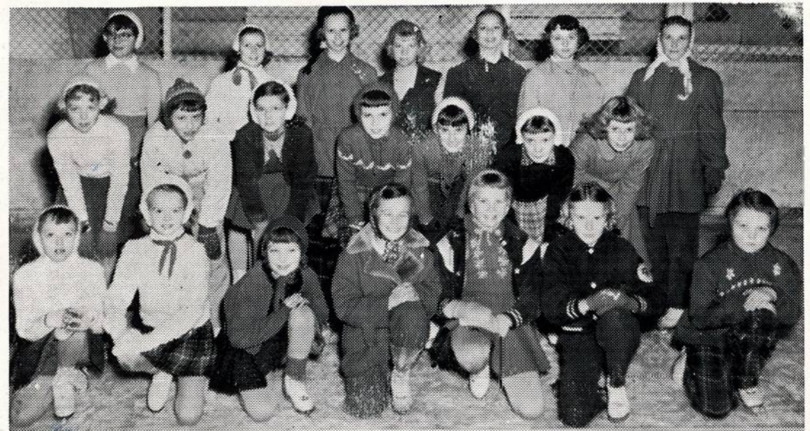
CHILDREN IN MARY, MARY, QUITE CONTRARY