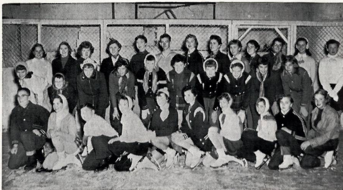
GROUP 1 and 2 INTERMEDIATES