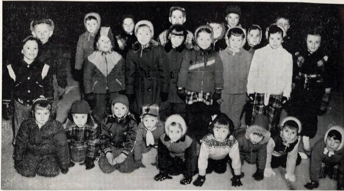
GROUP 1 BEGINNERS