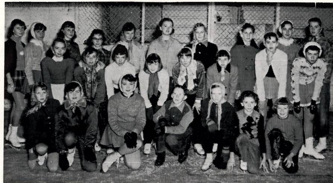
GROUP 3 and 4 OF INTERMEDIATES